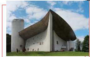
NOTRE DAME DU HAUT